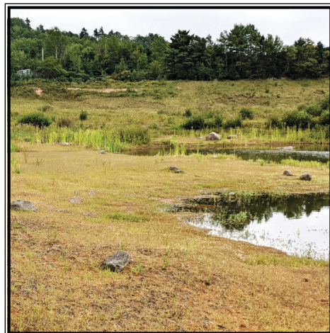
Windsor Forks quarry restoration site, Windsor, NS