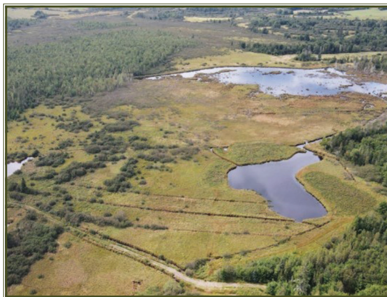
Completed wetland restoration site, Upper Stewiacke, NS