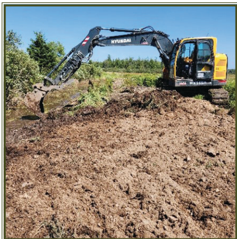
Wetland restoration construction, Upper Musquodoboit, NS