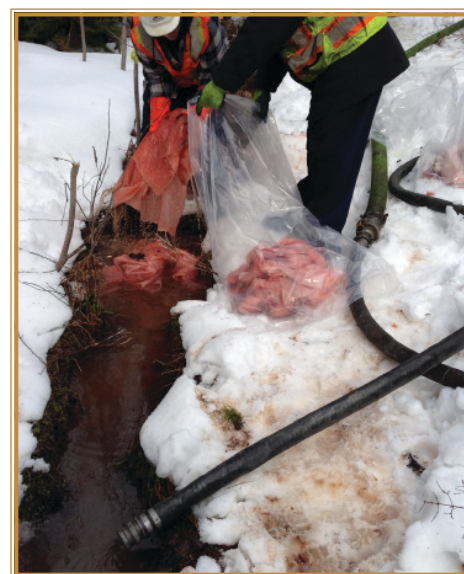
Collection of free phased domestic fuel oil from a watercourse during an emergency response to a fuel oil release