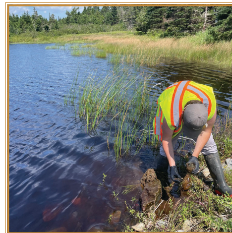
Field staff collecting a sediment sample for metals analysis

The SAR team consists of 24 environmental site professionals with extensive experience working with site owners, insurers, government agencies, and developers to help assess, remediate, and manage contamination that may impact human health and the environment. This includes impacts to soil, groundwater, sediment, surface water, and air quality as well as risks associated with hazardous building materials. Strum takes pride in offering the most effective and efficient solutions to address our client's needs and objectives, ensuring that regulatory compliance is met.