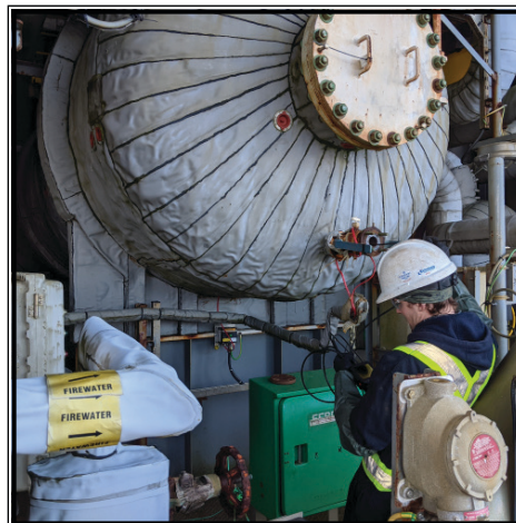
Assessment of residual fluids within a storage tank during a Hazardous Materials Assessment of a decommissioned marine platform